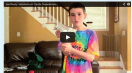
Get Ready: Individual/Family Preparedness