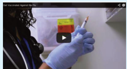
Get Vaccinated Video Series